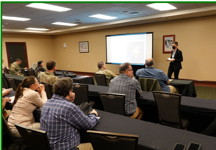
The Conference featured more than two-dozen in-person and virtual presentations