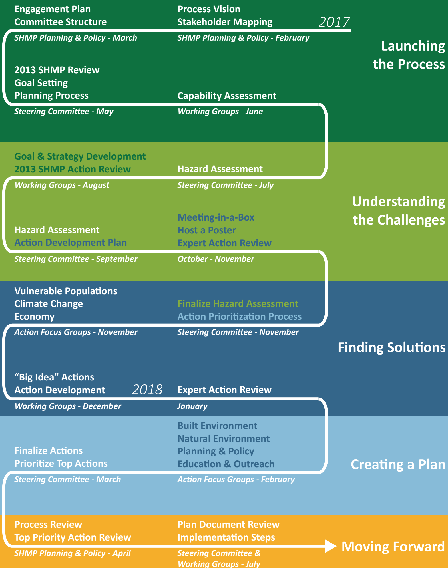
FIGURE 1: 2018 Vermont SHMP - Stakeholder Engagement Process