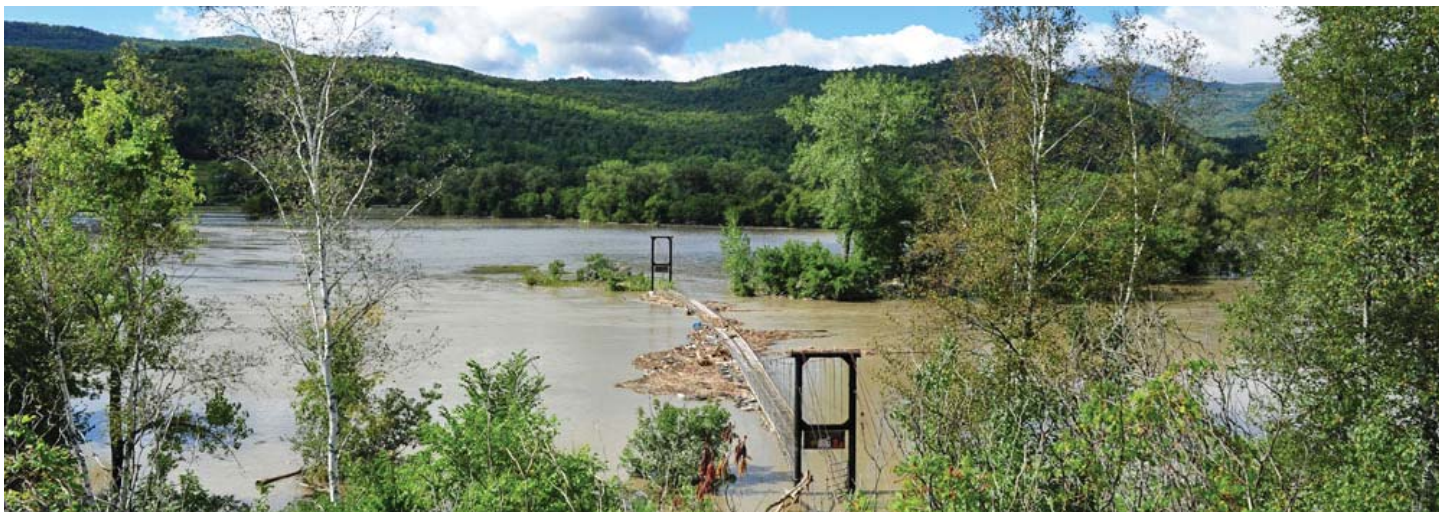
Snowmobile bridge near Waterbury, VT flexes as debris and water rush past following Tropical Storm Irene

Score = Probability x Average Potential Impact