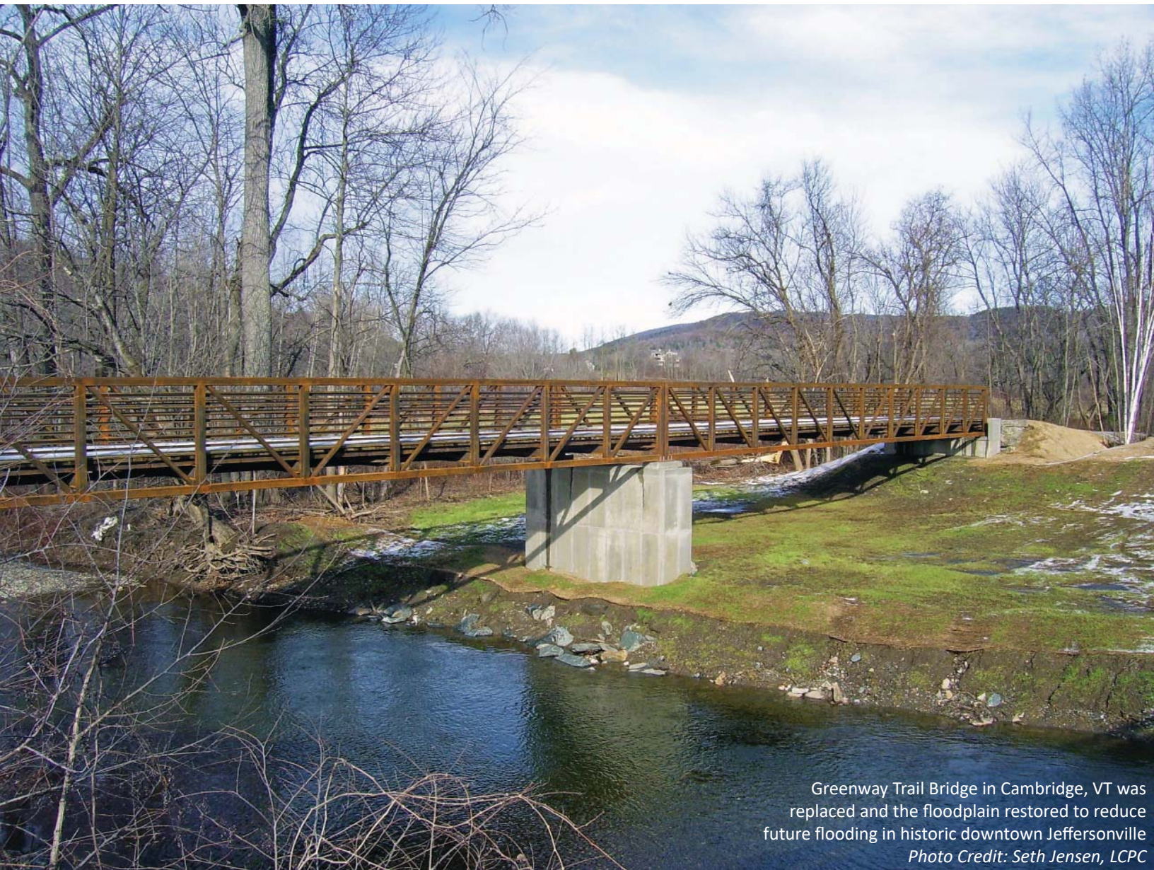
Greenway Trail Bridge in Cambridge, VT was replaced and the floodplain restored to reduce future flooding in historic downtown Jeffersonville

Since Tropical Storm Irene, Vermont has been proactive in addressing its vulnerability to natural hazards. Through various funding sources, primarily the Hazard Mitigation Assistance (HMA) grant programs, we have acquired and demolished nearly 150 flood-vulnerable properties, completed approximately 70 infrastructure improvement projects, developed LHMPs for 142 municipalities and carried out a handful of 5% Initiative projects. Since the 2013 SHMP, VEM mitigation staff have been more aggressive in applying for Pre-Disaster Mitigation (PDM) and Flood Mitigation Assistance (FMA) funding as a supplement to our Hazard Mitigation Grant Program (HMGP) disaster funding. Most notably, through coordinated efforts with State, regional and local project developers, Vermont has been prioritizing larger mitigation initiatives that more comprehensively address vulnerability, like floodplain restoration efforts in Middlebury, Cambridge, Brattleboro and Waterbury.